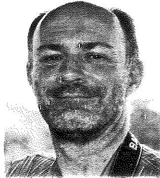
March 2001.

voice: ++ 49 30 2093 8516 fax: ++ 49 30 2093 8528 email: Jason.Dunlop@rz.hu-berlin.de